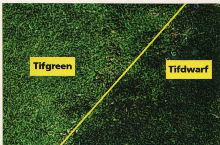
Tifdwarf bermudagrass (right) is probably a vegetative mutant from Tifgreen bermudagrass.

The dinitroaniline herbicides, oryzalin and