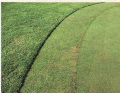
▲ 14-0-28 plus Turf Enhancer .2 ounces of paclobutrazol per acre

two weeks after the first application. Cooler spring temperatures can delay this somewhat. The degree of discoloration of the Poa will vary with the rate of active ingredient applied. Below are two examples of the degree of discoloration of Poa after an initial application.