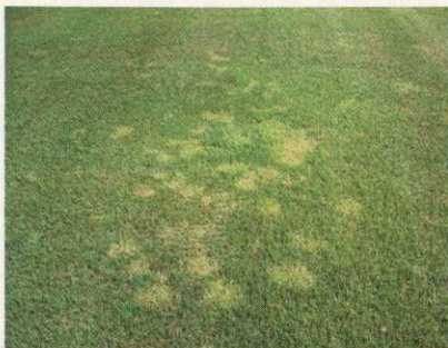
▲ 31-3-7 plus TGR .5 ounces of paclobutrazol per acre

■ Under regulation, the desired turf species will begin to fill in areas of weakened Poa annua . You can enhance this effect by overseeding 10 to 14 days after an application of TGR or Turf Enhancer.