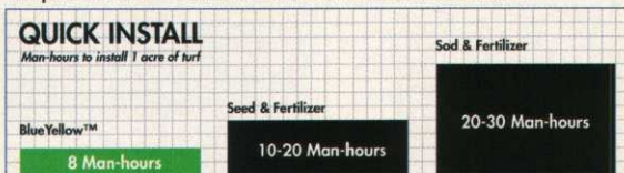
Chart figures represent an average of a variety of traditional application methods over various types of terrain.

BlueYellow™ is distributed in the United States and Canada exclusively through John Deere One Source. Call your local distributor for information. BlueYellow™ is owned by Koch Cellulose, LLC, a wholly owned subsidiary of Koch Industries, Inc., and is manufactured in Milwaukee, WI.