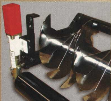
The Vertical Mowing System Attachment—a $3,195 Value, FREE!

For more information on the 8400 and the Vertical Mowing System, call Stan at National Mower at 1-888-907-3463, x105, or email stan@nationalmower.com . If you have high-speed Internet access, you can view a demo video online at www.nationalmower.com .