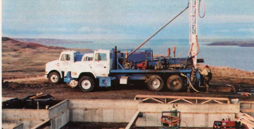
A well-drilling rig goes to work next to one of Sutton Bay's living quarters.

West Plains Engineering has consulted on installation of geothermal sys-