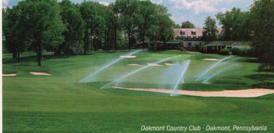
Oakmont Country Club - Oakmont, Pennsylvania

"Hiring a professional irrigation consultant is very important to the success and outcome of a major irrigation installation or restoration project. The planning and specifications, prepared by a professional consultant, lay the foundation for lasting solutions that achieve environmental and business objectives."