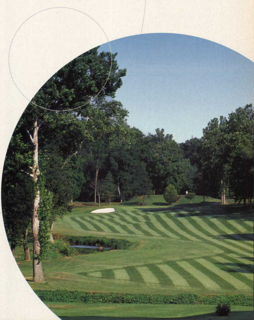
exhibit improved dollar spot resistance. Its medium density and upright aggressive growth habit make it the perfect choice for fairways, greens, and tees. Independence is the top performing commercially available creeping bentgrass in recent university trials. Declare your Independence. Get the new University data by calling your LebanonTurf distributor, or call 1-800-233-0628, or visit www.LebanonTurf.com , and find out more about Independence, the next generation in creeping bentgrass.

The next generation is here and it is called Independence.