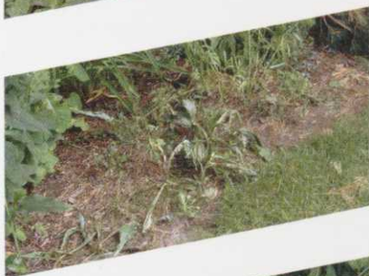
1 day after treatment