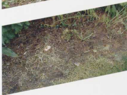
5 days after treatment

QuikPRO ® Herbicide Powered by Roundup TECHNOLOGY™