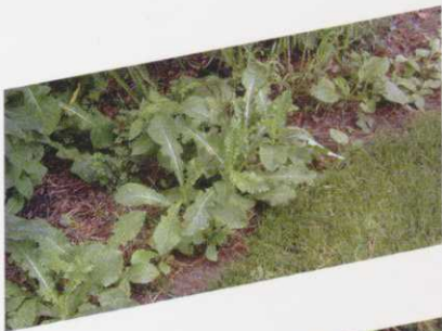
Prior to treatment