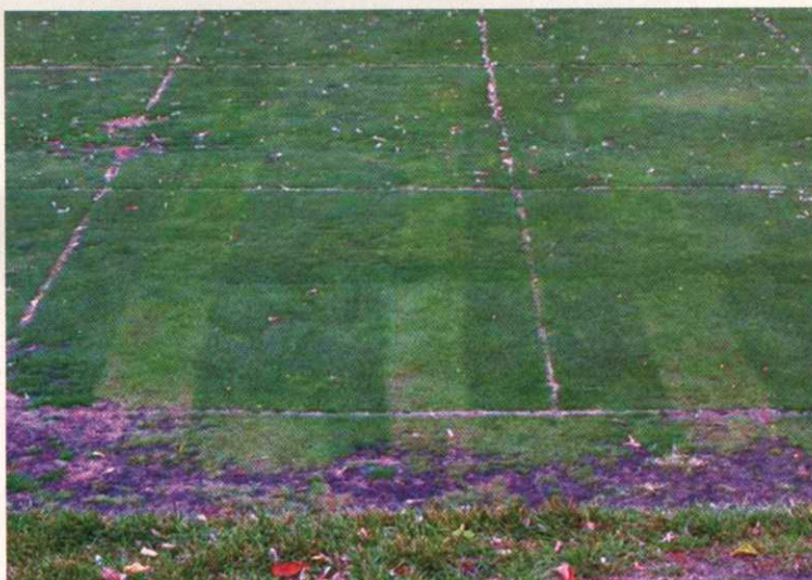
This off-target movement of a sulfonylurea herbicide occurred after it was tracked by a mower.

Sulfonylurea herbicides have great potential for solving problems that previously had few to no solutions. Their ability to selectively control