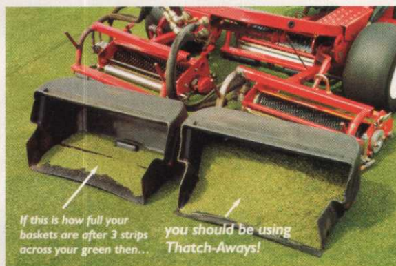
The standard verticutting unit on the left was set at a 3/16-inch below surface level. The Thatch-Away unit on the right was set at just 1/8-inch below the surface level.