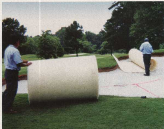
SANDTRAPPER – The premier bunker renovation solution

How often has the old sod staple given you grief? IVI-GOLF has developed the V-STAPLE to improve holding power by more than 200 percent yet reduce the "benders" through its staggered prong design. Available in a variety of widths and gauges, this staple will soon become the "new standard" for securing materials around the golf course.