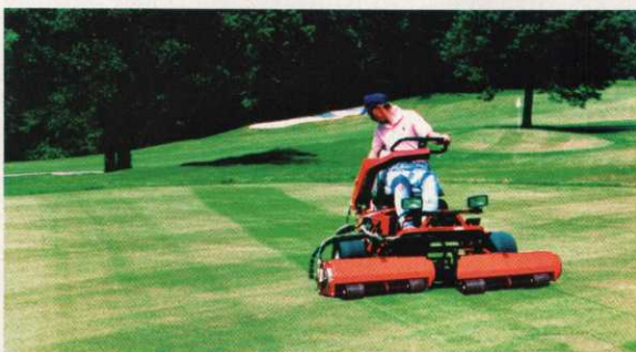
Topdressing dispersion is one of the many uses of the universal roller.

The revolutionary Thatch-Away SUPA System will operate