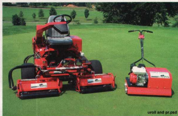
The set of universal rollers displayed on a mower can be easily converted to fit the mower or any other popular greensmower. Also shown is the Power Roller™, ideal for golf courses that prefer to walk mow.

seven different cassettes to handle those jobs you never had time for before, with the speed and ease that your triplex gives you. The cassettes include the verticutter, scarifier, groomer, deep slicer, greens spiker, star slitter and rotary brush. No tools are needed to switch cassettes. Simply undo the latches and swap cassettes in seconds.