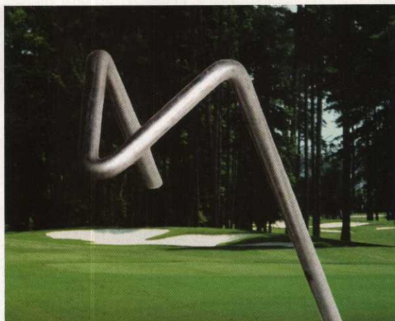
V-STAPLE – Not just a sod staple