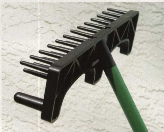
THE TRAPPER – New, innovative bunker rake in hand and machine models