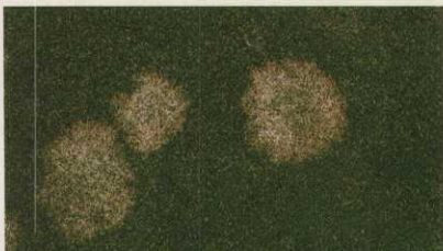
Dollar spot (top view)

humid conditions caused an upswing in pythium blight. "You couldn't have created better conditions for pythium than those we experienced this summer," he said.