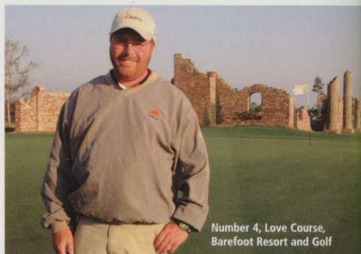
Number 4, Love Course, Barefoot Resort and Golf