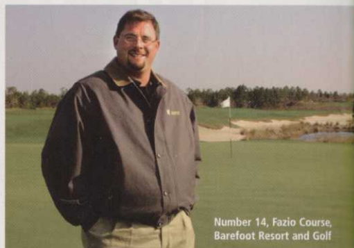
Number 14, Fazio Course, Barefoot Resort and Golf

Resort guests comment on A-1's upright growth and true putting."