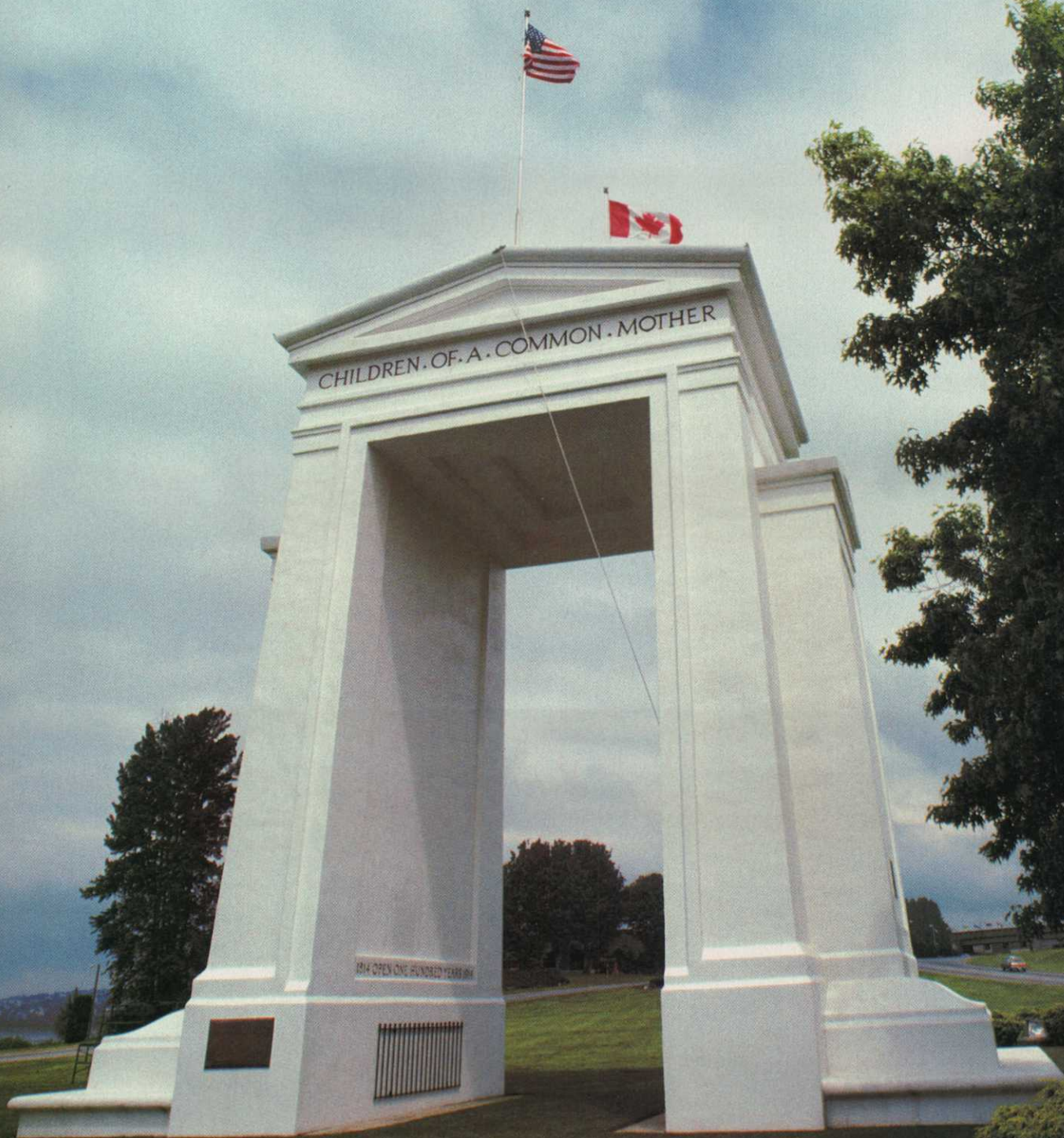
The Peace Arch on the boundary between Blaine, Wash., and Douglas, B.C., celebrates the unguarded United States/Canadian border.