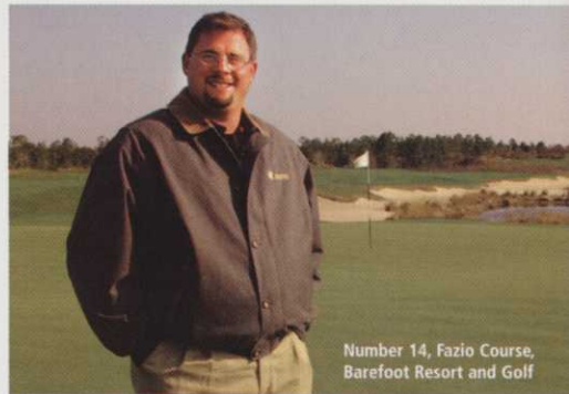
Number 14, Fazio Course, Barefoot Resort and Golf

Resort guests comment on A-1's upright growth and true putting."