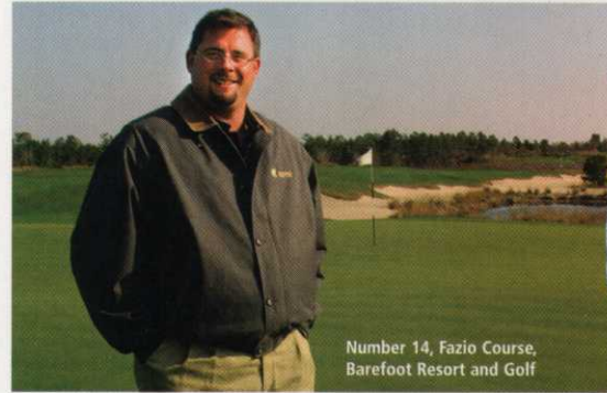
Number 14, Fazio Course, Barefoot Resort and Golf