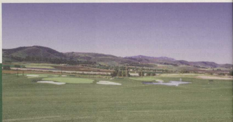
Tom Barber Golf Center - Moorpark, California