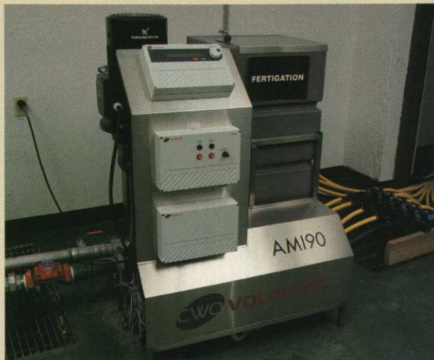
The fertigation system has improved plant use of nutrients. "As much as 95 percent of nutrients are available and used by the plant," certified superintendent Dan Pierson says.

the spreaders and tractors and use the extra water needed to water granular fertilizer in," Pierson says.