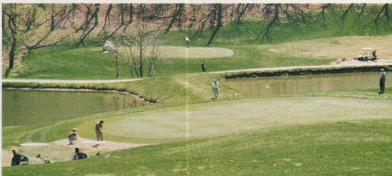
SYCAMORE CREEK GC