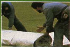
Easy to install & remove