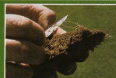
Deeper root development