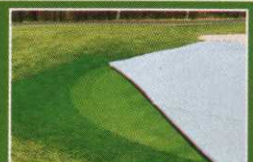
Any custom size cover