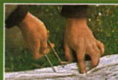
Anchor pegs supplied