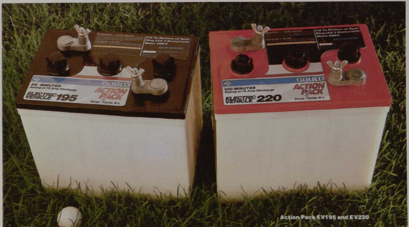
Action Pack EV195 and EV220

Committed to making batteries better than ever.