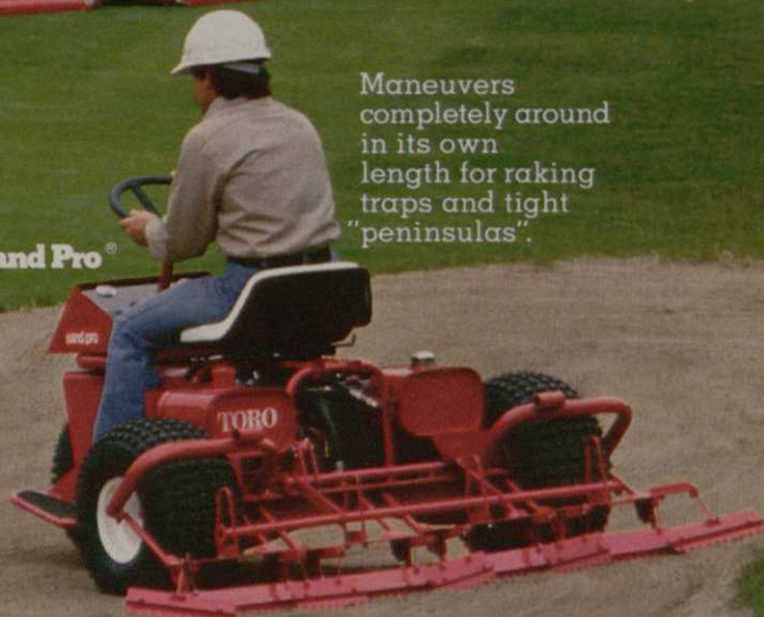
Sand Pro ®

Maneuvers completely around in its own length for raking traps and tight "peninsulas".