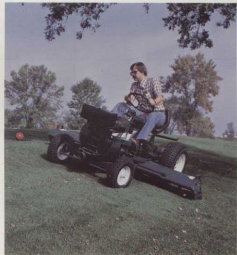
Model 84" Triplex