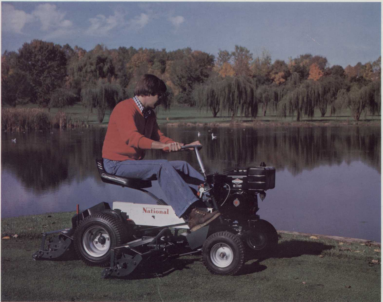
Model 68" Triplex