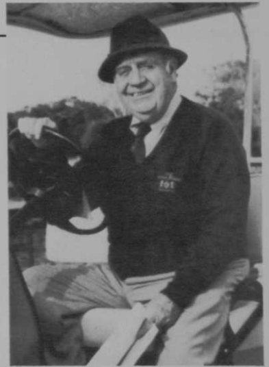
Renowned golf course architect Robert Trent Jones has been selected by Seabrook Island Co. to design the Island's second golf course. Completion is expected by summer 1980. Jones was expected to follow his maxim of golf course design at Seabrook: "Every hole should be a hard par and an easy bogey."