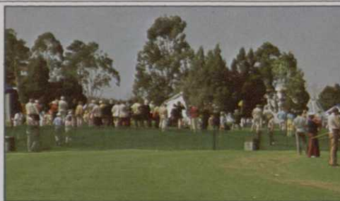
FAIRWAY CROWD CONTROLS