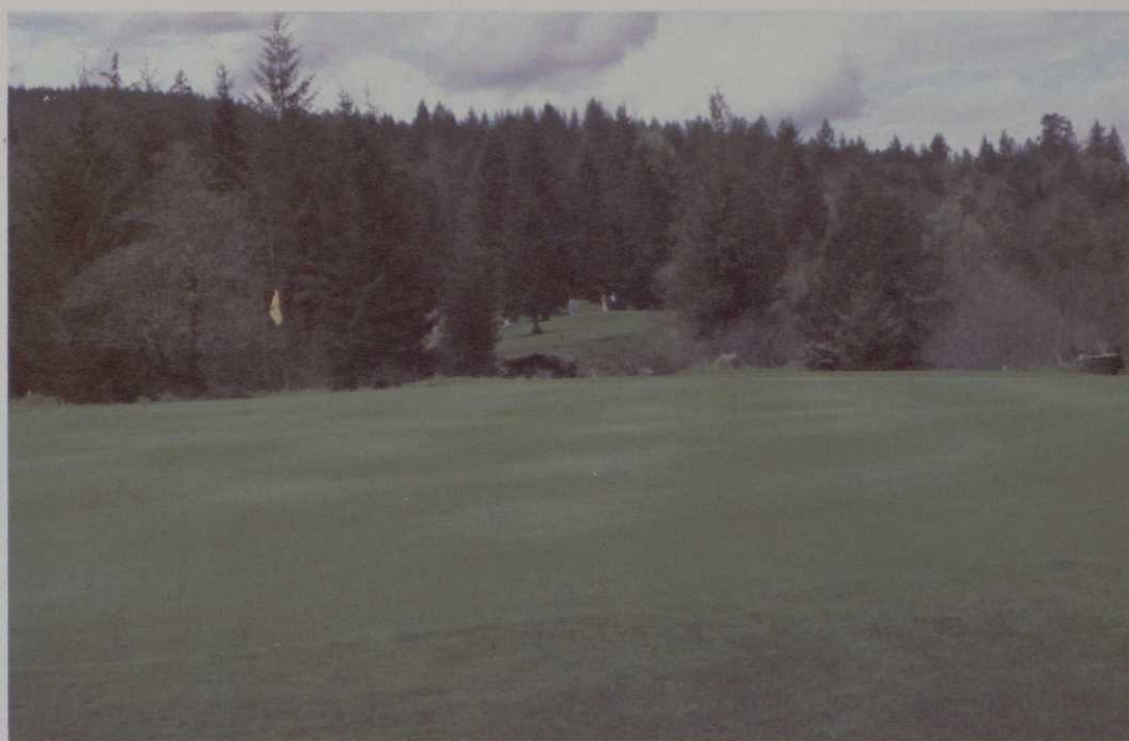
The canyon separating the tee and green on number six is home for many golf balls. The golfer on the tee has just sent it another resident.