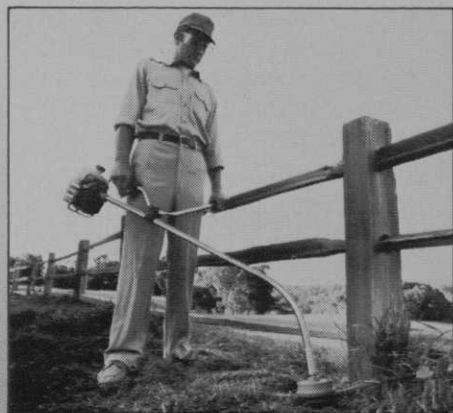
Model 609 is lightweight and maneuverable.

Rugged, reliable, and ready-to-go, WEED EATER trimmers have powerful 2-cycle engines and heavy-duty nylon cutting line. So they'll fight your tough cutting battles. Anytime, and every time.