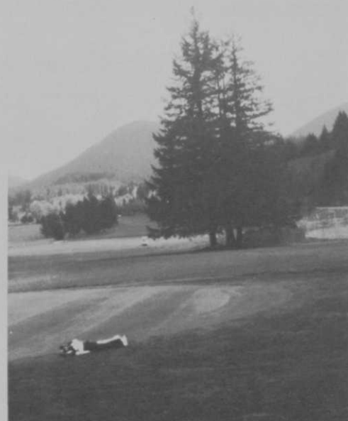
This is number four where the Pennncross ad was shot. Cutler moved most of these trees in himself, with a tree spade.