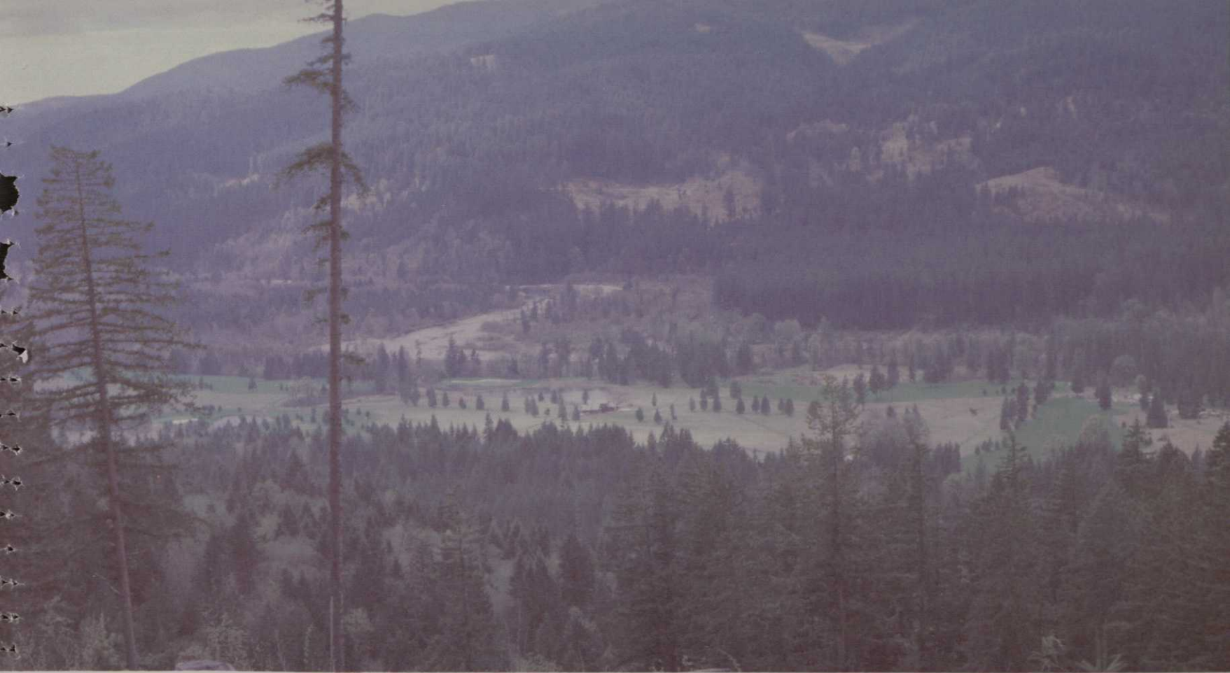
This is a high ground view of number one and number nine. The island in the upper bend of the Little North Fork will be the site of number 15.