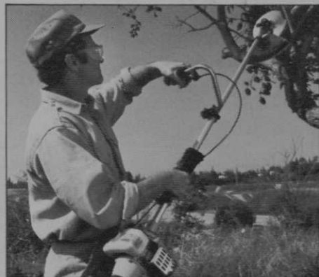
Model 698 trims vines and limbs.

So, when you're faced with a tough grounds maintenance mission, get a WEED EATER trimmer: THE ULTIMATE WEAPON. It'll fight all your cutting battles.