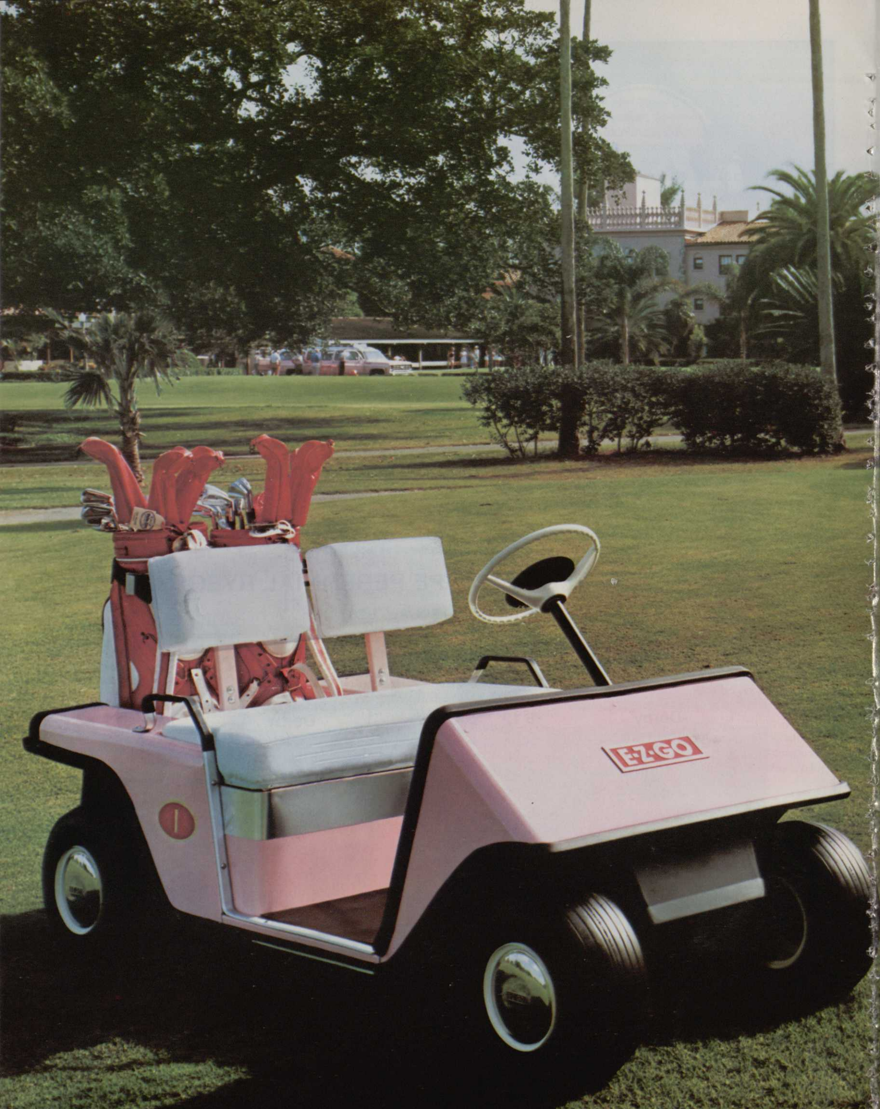
Photographed at Boca Raton Hotel & Club, one of North America's great golf resorts.