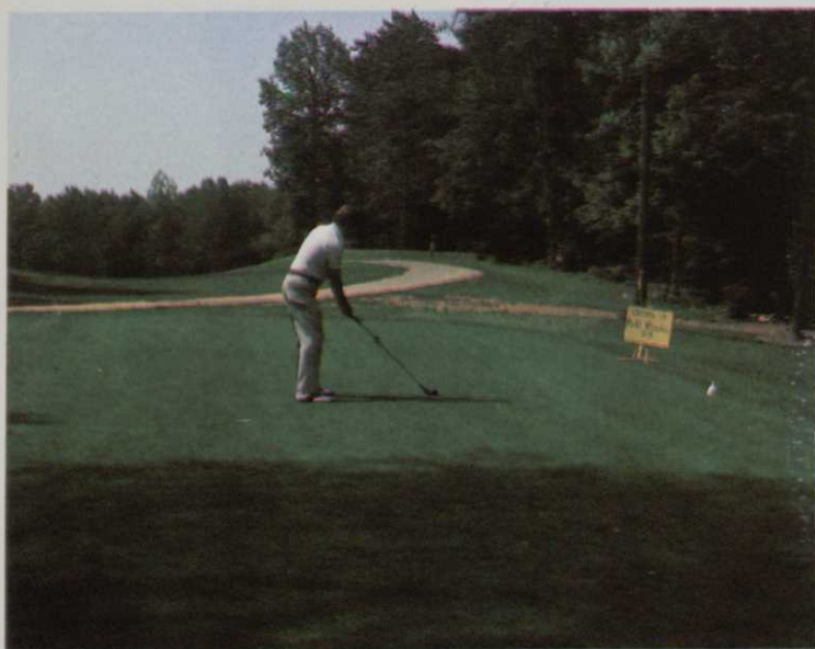
Hole #6 on the 4th nine at Congressional Country Club, Bethesda, Maryland had tees and greens seeded to Penneagle in September of 1977. Penneagle green was opened for play in June of 1978.

At Last! One Grass That is Designed to Cover Your Entire Course...Tees, Fairways and Greens!