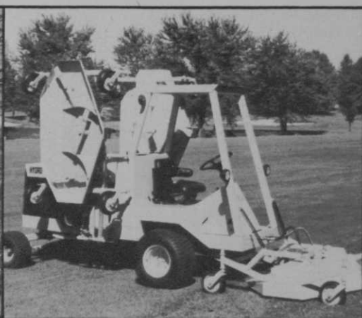
Mowing equipment/p. 24