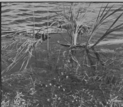
Aquatic weed control/p. 20