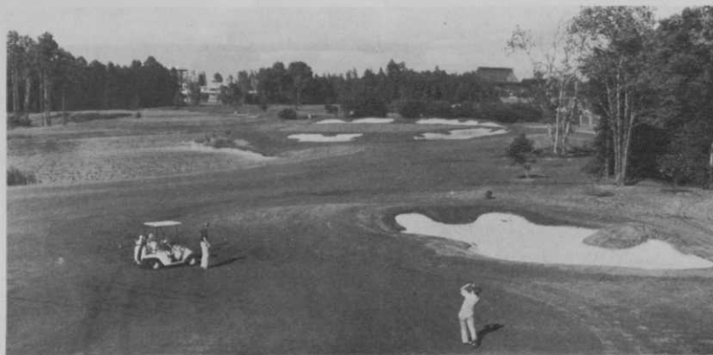
Florida boasts "the country's greatest tourist attraction," Disney World, which in itself has several great golf courses. Visible behind the ninth hole on the Magnolia course are the Contemporary and Polynesian Resort hotels.

Comments made so far are not meant to indicate that there are no problems connected with golf in the cities of the deep south, as such is not the case. A recent survey of the metropolitan Atlanta area showed that although this city could normally be expected to support 18 full-sized courses, it only has seven. And these, with only two exceptions — in spite of having ample maintenance personnel, supplies, and equipment — are very poorly maintained. There is a great opportunity in cities such as Atlanta with a 55 percent black population that includes a great number of people who until recently never had the opportunity to get on a course. This same situation applies to several other southern cities.