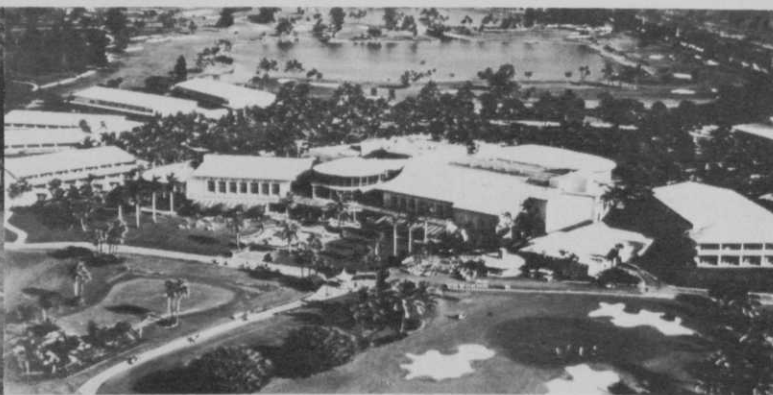
Doral Country Club in Miami "is as close to the ultimate golf resort as one may find." It includes four beautiful 18-hole courses (including the famed "Blue Monster") and a 9-hole par-3 layout surrounding a luxurious, though somewhat deteriorated, hotel.

off. They use the off week for golf and relaxation, including liberal use of bar facilities.