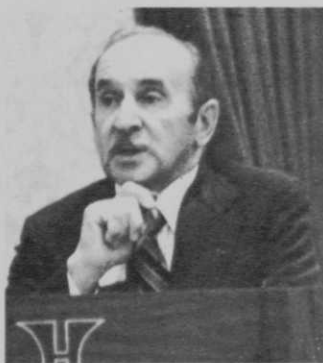
Radko: efficient use of water and chemicals

Green Section, said a major concern of the GCSAA will be "ecological matters and ways to find more efficient use of materials."