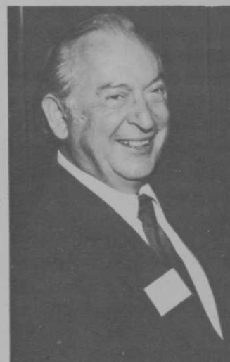
Mascaro: mechanized maintenance

Grau agreed that the development of efficient golf course equipment has been important to the industry, but