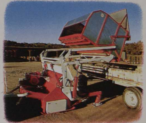
Hydraulic dumping feature of HL models can dump at any height up to 8½'.

To find out about the most complete line of Turf Sweepers