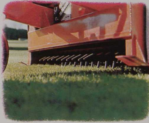
Patented rubber pick-up fingers are the worst thing that can happen to turf debris.

Then along came Jacobsen's unique rubber finger pick-up system. You'll find it used on all six of our Sweeper models. They pick up just about everything that you'd call debris, including branches up to 3" in diameter.