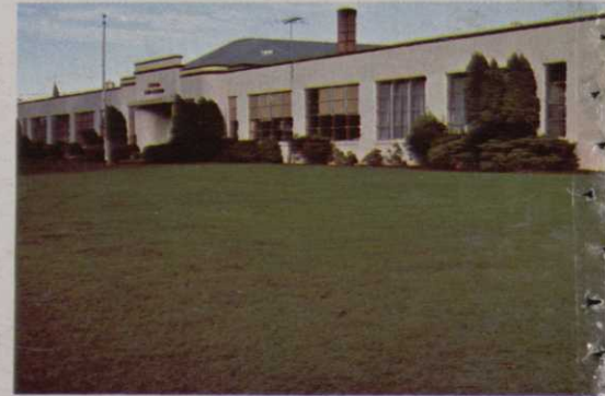
School grounds in St. Paul, Oregon gets plenty of traffic but still looks great.