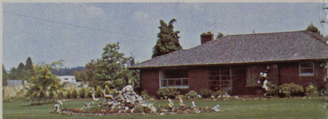
Home lawn near Woodburn, Oregon after three years in 100% Manhattan.

Manhattan fine leaf perennial ryegrass is the versatile grass. Excellent for golf tees and fairways, parks and athletic fields, home lawns. Developed at Rutgers University, New Brunswick, New Jersey, grown in Oregon under rigid certification and quality control.