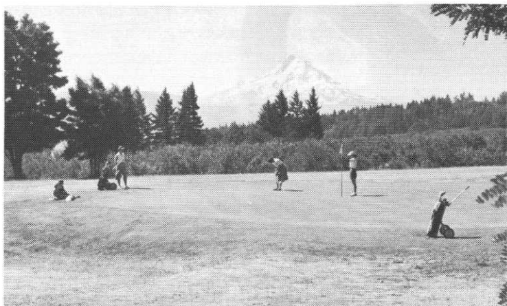
TOP: Portland skyline as seen from the east shore of the Willamette River. BOTTOM: Mt. Hood is visible from practically everywhere in and around Portland, including its many golf courses. Shown is the Hood River Golf Course.