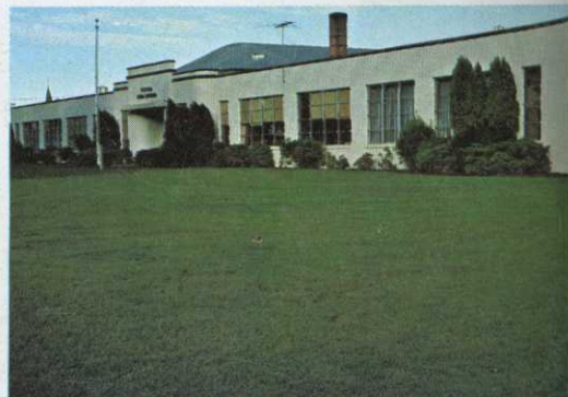
School grounds in St. Paul, Oregon gets plenty of traffic but still looks great.