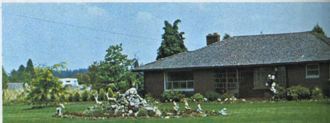
Home lawn near Woodburn, Oregon after three years in 100% Manhattan.

Manhattan fine leaf perennial ryegrass is the versatile grass. Excellent for golf tees and fairways, parks and athletic fields, home lawns. Developed at Rutgers University, New Brunswick, New Jersey, grown in Oregon under rigid certification and quality control.