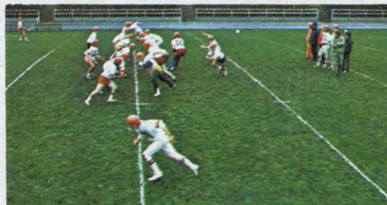
Sprague football stadium, Salem, Oregon holds up well even in the soaking rains of Oregon's fall months.