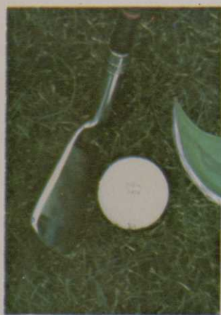
FINE FESCUES the Fairway Grass