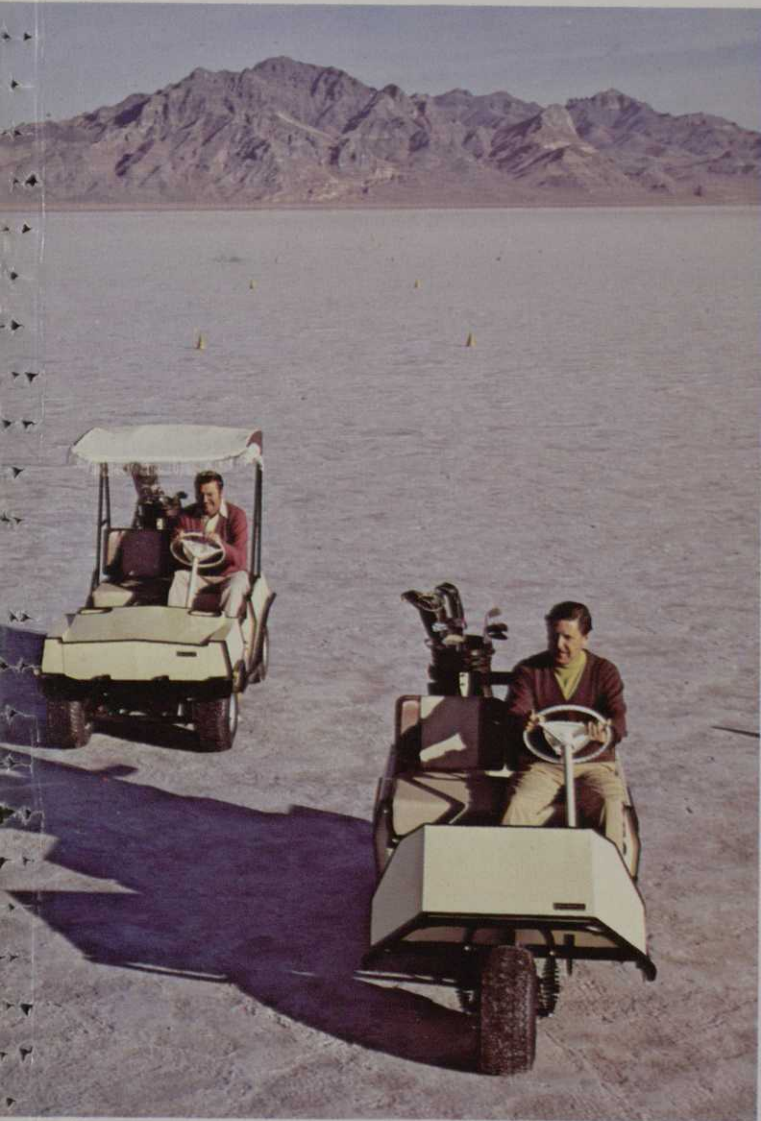
Westinghouse golf cars tamed the Bonneville Salt Flats. 33.9 miles without recharging.

For more information write: Westinghouse Electric Vehicles, Westinghouse Building, Gateway Center, Pittsburgh, Pa. 15222. MF-8-73