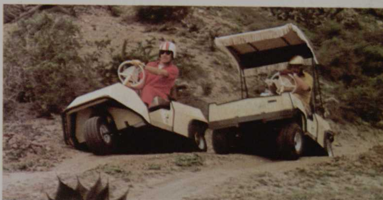
Westinghouse golf cars tackled the Baja. 50 miles of tough, rugged waste. All tests sanctioned by the U. S. Auto Club.