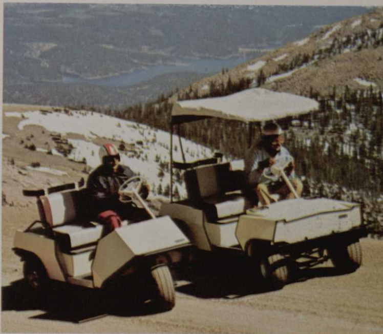
Westinghouse golf cars topped Pikes Peak. A grueling 12.42-mile climb.