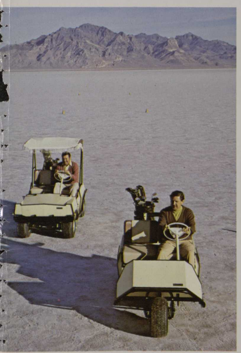
Westinghouse golf cars tamed the Bonneville Salt Flats. 33.9 miles without recharging.

Hills. Distance. Rough terrain. The Westinghouse electrics have power to spare. They're built to take it. Day after day. On a simple overnight charge.