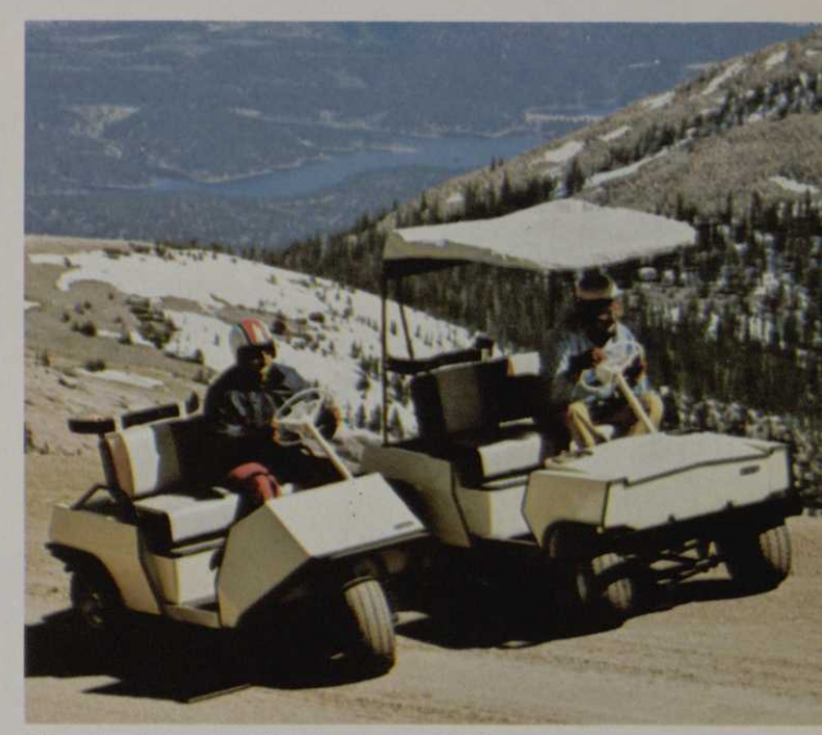
Westinghouse golf cars topped Pikes Peak. A grueling 12.42-mile climb.

For more information write: Westinghouse Electric Vehicles, Westinghouse Building, Gateway Center, Pittsburgh, Pa. 15222. MR-8-72