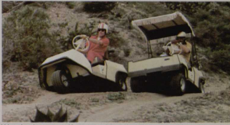
Westinghouse golf cars tackled the Baja. 50 miles of tough, rugged waste. All tests sanctioned by the U. S. Auto Club.