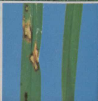
4. Leafspot comparison of disease-free Fylking and other elite bluegrass.

Another fine product of Jacklin Seed Company