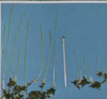
3. 11-day seedling comparison Fylking and another elite Kentucky bluegrass.