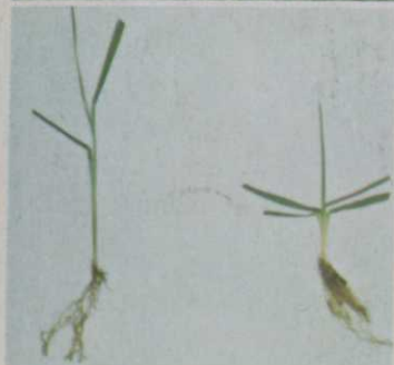
1. Comparison of Fylking (right) with another elite bluegrass plant.