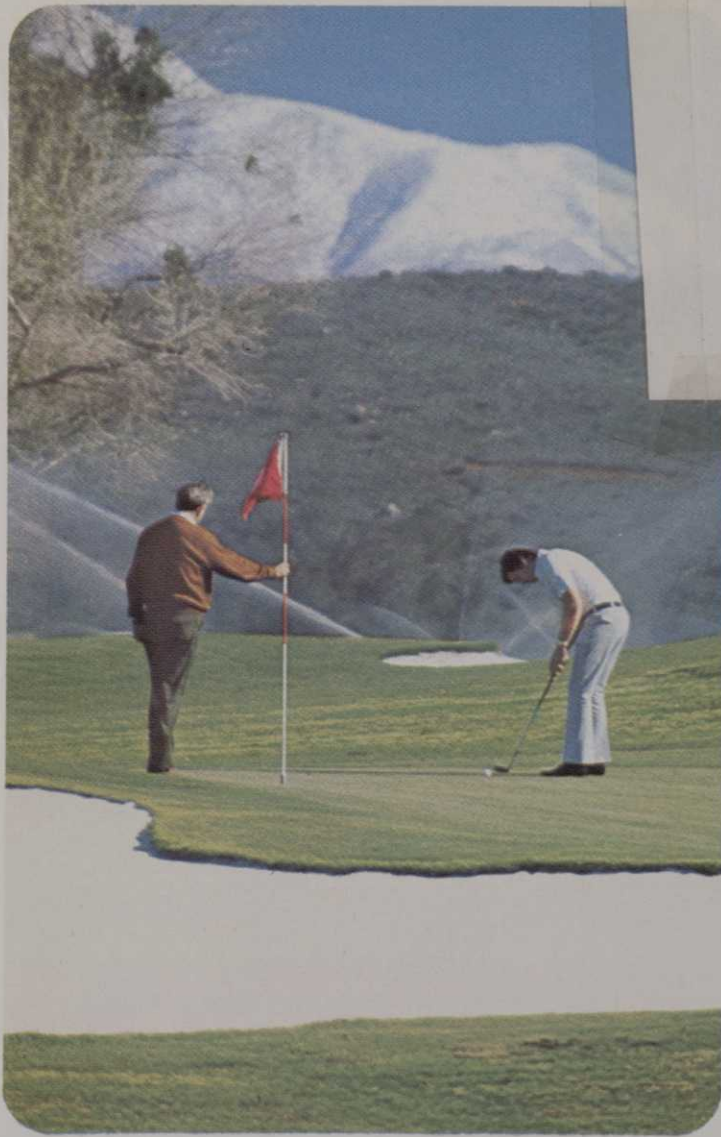
San Vicente C. C./Ramona, California Ready for play one year after start of construction.

can scramble individual control valves for maximum program flexibility.