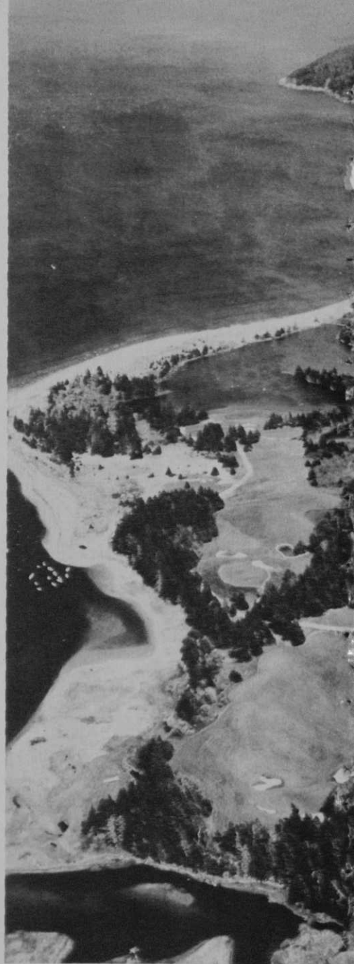
Preceding page: top, Jasper Park GC, Alberta; in "leaf," Le Manoir Richelieu, Quebec. Above: Keltic GC, Cape Breton Highlands National Park, Nova Scotia.

OAKFIELD: At 6,975 yards (par-72), one of the outstanding tests in the province. Situated on Grand and Fish