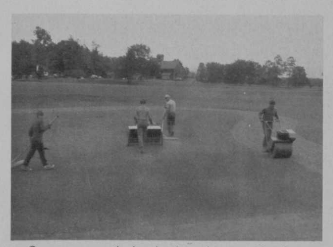
Greens are meticulously shaped to specifications and groomed before seeding.