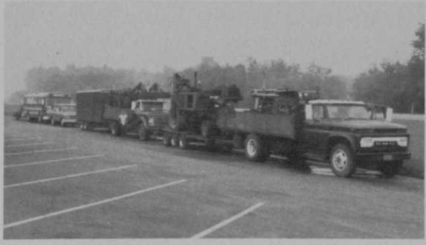
An array of our modern mobile equipment, ready to move to another site.

Nothing turns a golfer off quicker than ruining his clubs on fairway stones. Nothing kills play on a golf course faster than unhappy golfers with damaged woods and irons.