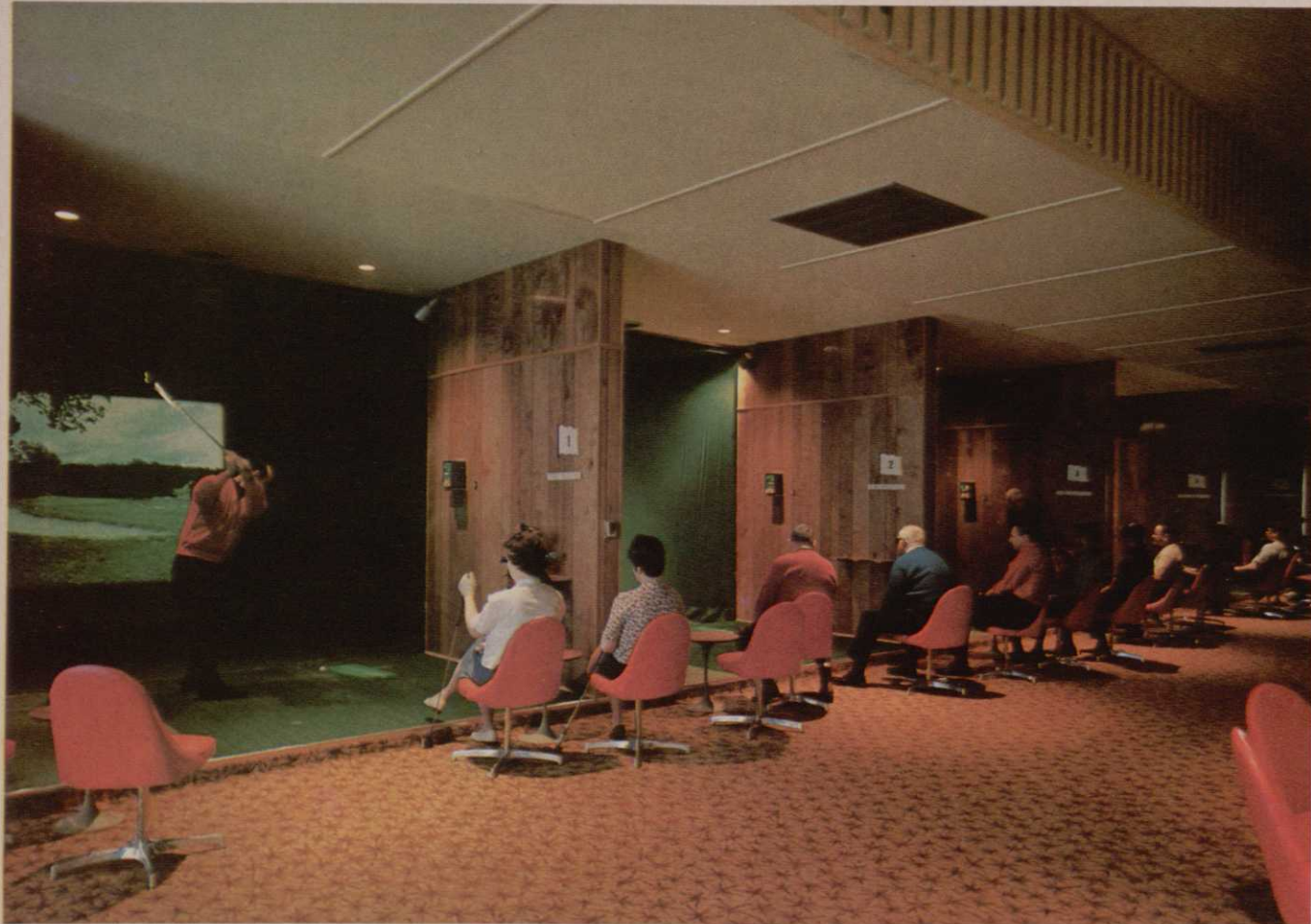
Typical high-income producing GOLFOFORMAT wing in operation.