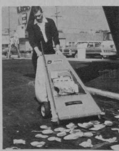
Circle No. 124 on reader service card

American Cleaning Equipment Corp. announces the Astro-Vac 30-inch vacuum, which picks up grit, paper and other bulky debris. It is stored in an all-metal cabinet, which is designed for outside installation, and it can be anchored through the floor or a side panel. Less than five-square feet is required for storage.