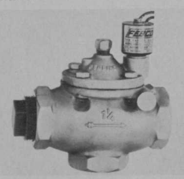
Circle No. 121 on reader service card

Febco, Inc., announces a two-way automatic electric valve for operating sprinkler lines. The valve features three openings and can be used as either an angle or globe valve, depending on slug placement. These diaphragm type valves are 150 pound WOG brass and come in four sizes from one to two inches.