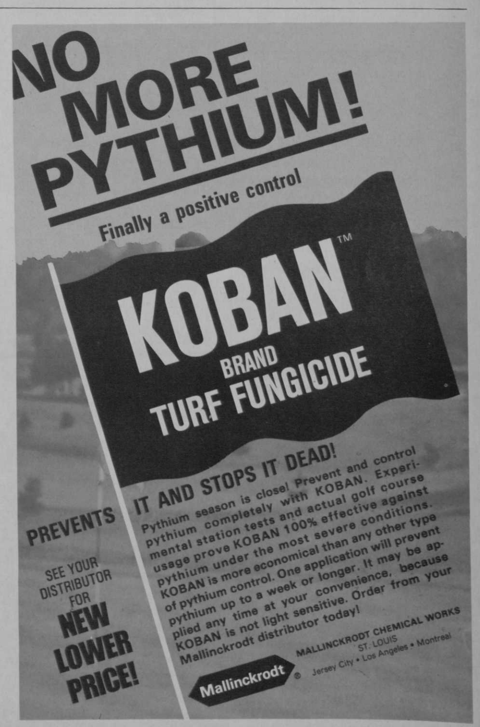
For more information circle number 222 on card

How far a fence has to be installed from a street or highway is a point that should be checked while preparations for installation are being made.