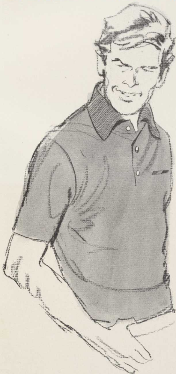
#2193 Three-button placket with hemmed sleeves, bottom and side vents. Embroidered parallelogram. White, navy, mimosa, celeste, stone, riviera blue, red, fern, melon. Sizes S, M, L, XL, XXL. $7.50

You can see the Izod quality and fashion in this newest line of fun wear. Handsomely embroidered with the colorful parallelogram that will soon be as distinctively popular as our famous crocodile. These comfortable, carefree knits are 50% Dacron® polyester, 50% cotton. Put the latest Izod look in your display case, and you'll profit from new sales interest in your customers' longtime favorite.