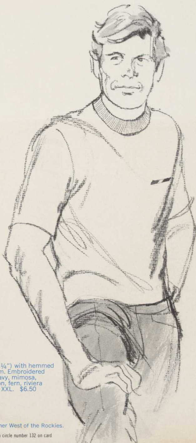
#2194 Hi-crew neck (1 1/4") with hemmed cuffs, side-vented bottom. Embroidered parallelogram. White, navy, mimosa, celeste, stone, red, melon, fern, riviera blue. Sizes S, M, L, XL, XXL. $6.50