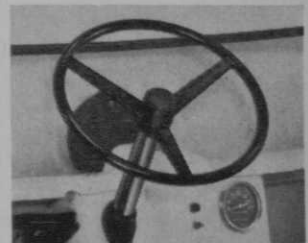
NEW STEERING WHEEL is offered as optional extra. Provides 8'7" turning radius. Fourteen other useful Harley-Davidson options available.

For more information circle number 214 on card