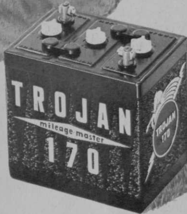
TYPE J-170W 170 Ampere Hour Capacity