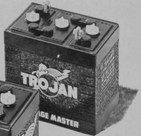
TYPE J-190W 190 Ampere Hour Capacity