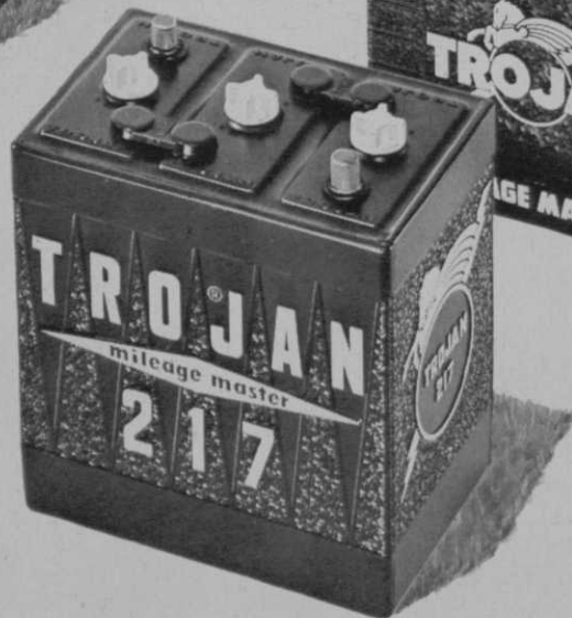
TYPE J-217W 217 Ampere Hour Capacity This type one inch taller