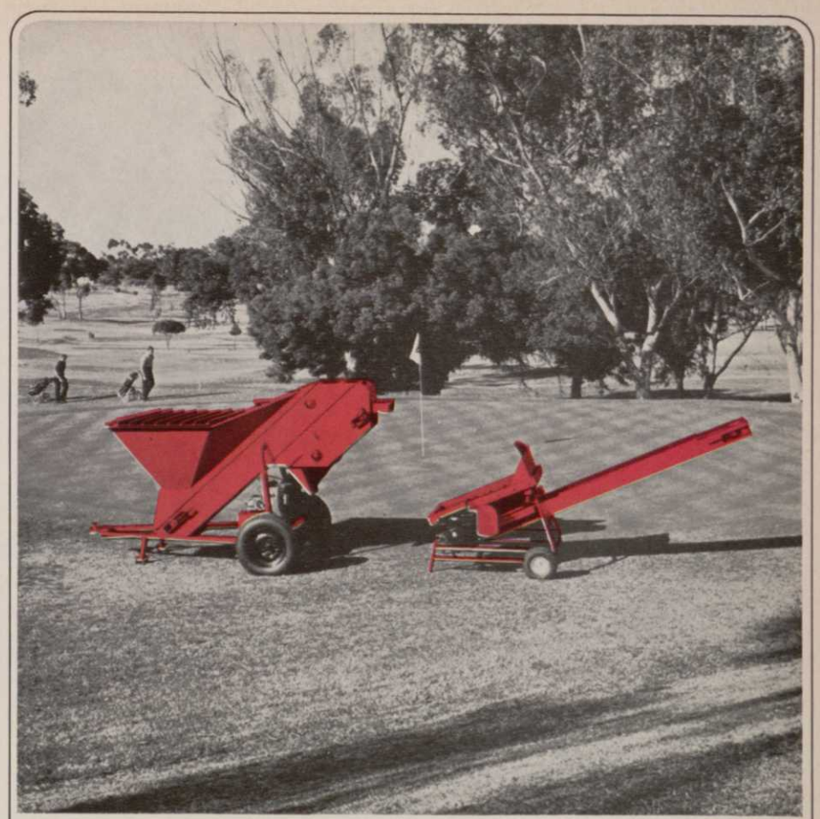
OVERSIZE TIRES (AS SHOWN) OPTIONAL