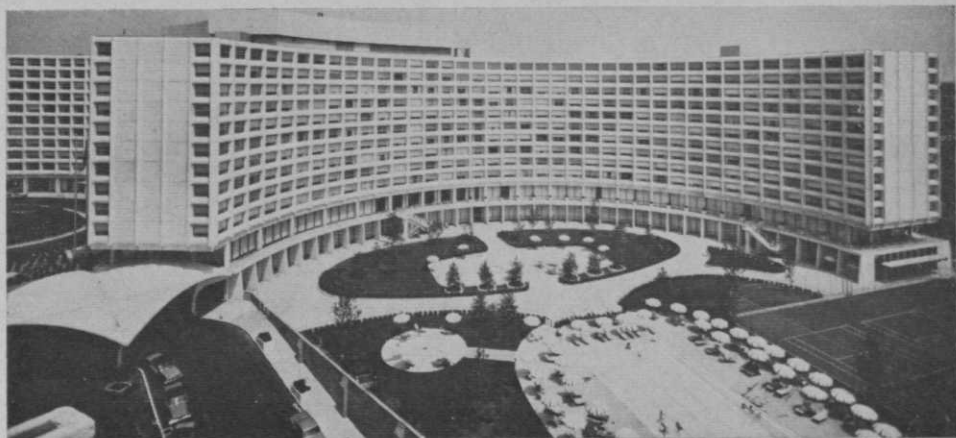
The imposing Washington Hilton, Washington, D.C., (above) will be the site of the 38th International Turfgrass Conference and Show.