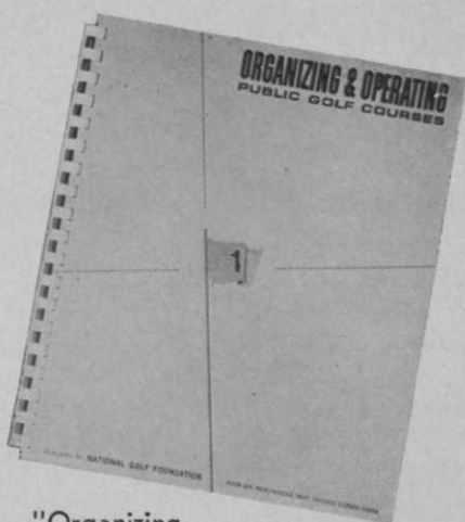
"Organizing And Operating Public Golf Courses"—$7.50 Postpaid

An authoritative publication of current facts, statistics and other pertinent data concerned with the initial planning, construction and actual operation of the private country club. Specifically it includes "Guide Lines for Planning and Organizing Private Golf and Country Clubs," the latest statistics on golf course growth in the United States, "Planning and Building the Golf Course," specifications for golf course construction, a list of golf course architects, a sample construction contract, a suggested list of course maintenance equipment and course maintenance costs studies. Also are sections dealing with the clubhouse, club by-laws, securing a golf professional, membership campaigns and actual case histories on the planning, construction and operation of private golf clubs and in addition a statistical survey on membership costs, dues, transfer fees, locker fees, bar and dining room operations, golf cars and the golf professional.