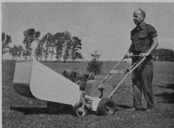
Renovate deep thatch and clean in one operation with the new West Point VG-20 Verti-Groove.

See the VG-20 Verti-Groove and all West Point tools at the GCSAA Show, Washington-Hilton Hotel, Feb. 13 - 16, 1967 Booths 901 -02 -03