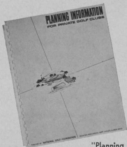
"Planning Information For Private Golf Clubs"—$7.50 Postpaid

An authoritative publication of current facts, statistics and other pertinent data concerned with the initial planning, construction and actual operation of the private country club. Specifically it includes "Guide Lines for Planning and Organizing Private Golf and Country Clubs," the latest statistics on golf course growth in the United States, "Planning and Building the Golf Course," specifications for golf course construction, a list of golf course architects, a sample construction contract, a suggested list of course maintenance equipment and course maintenance costs studies. Also are sections dealing with the clubhouse, club by-laws, securing a golf professional, membership campaigns and actual case histories on the planning, construction and operation of private golf clubs and in addition a statistical survey on membership costs, dues, transfer fees, locker fees, bar and dining room operations, golf cars and the golf professional.