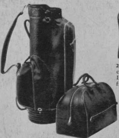
18-19. Give him a beautiful Royal golf bag of rugged Naugahyde® vinyl. In a wide range of styles, prices, and colors. From $17.95.