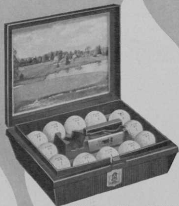
Gift case, "Brand-It" ball marker, dozen PLUS 25 balls with MacGregor's new, extra yardage Golden Core center... $15!

If it's a new Christmas idea, chances are it's from MacGregor. Look at all the choice ways you have to turn your pro shop into a gift shop... all packed with gift-giving appeal, all ready to make you extra profits.