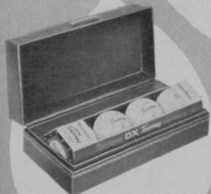
4 DX Tourneys, leatherette box... $5