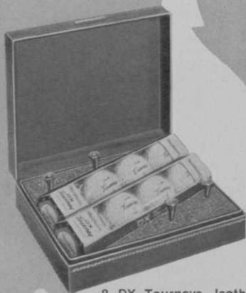
8 DX Tourneys, leatherette box, golden tees... $10

With one exception, these three Christmas ideas are unbeatable.