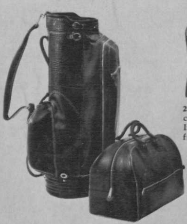
18-19. Give him a beautiful Royal golf bag of rugged Naugahyde® vinyl. In a wide range of styles, prices, and colors. From $17.95.