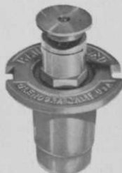
Rain Bird Sure-Spray Pop-Ups irrigate deep grass.