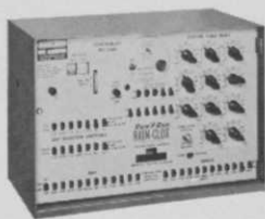
Rain-Clox Electronic Controller for reliable programming.