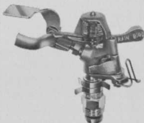
Our exclusive Precision Jet keeps water off walks and driveways.