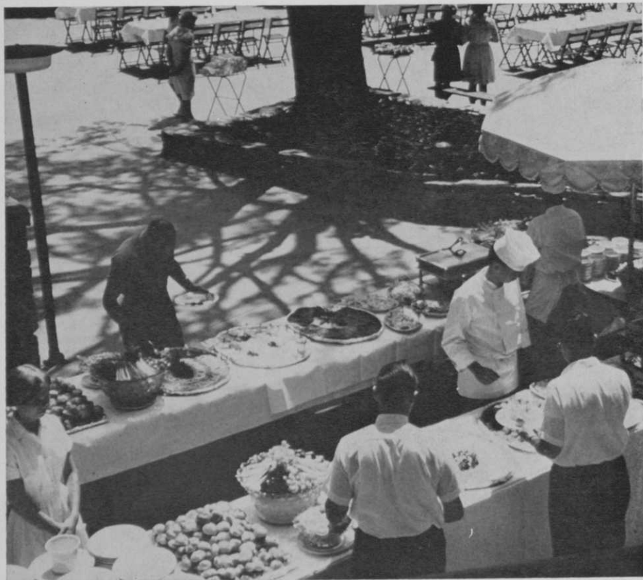
Attractive buffet on terrace at poolside can lure members away from backyard barbecue pits.