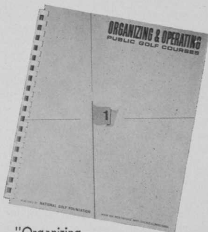
"Organizing And Operating Public Golf Courses"—$7.50 Postpaid

An authoritative publication of current facts, statistics and other pertinent data concerned with the initial planning, construction and actual operation of the private country club. Specifically it includes "Guide Lines for Planning and Organizing Private Golf and Country Clubs," the latest statistics on golf course growth in the United States, "Planning and Building the Golf Course," specifications for golf course construction, a list of golf course architects, a sample construction contract, a suggested list of course maintenance equipment and course maintenance costs studies. Also are sections dealing with the clubhouse, club by-laws, securing a golf professional, membership campaigns and actual case histories on the planning, construction and operation of private golf clubs and in addition a statistical survey on membership costs, dues, transfer fees, locker fees, bar and dining room operations, golf cars and the golf professional.