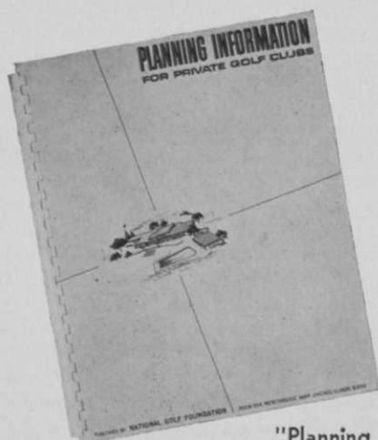
"Planning Information For Private Golf Clubs"—$7.50 Postpaid

An authoritative publication of current facts, statistics and other pertinent data concerned with the initial planning, construction and actual operation of the private country club. Specifically it includes "Guide Lines for Planning and Organizing Private Golf and Country Clubs," the latest statistics on golf course growth in the United States, "Planning and Building the Golf Course," specifications for golf course construction, a list of golf course architects, a sample construction contract, a suggested list of course maintenance equipment and course maintenance costs studies. Also are sections dealing with the clubhouse, club by-laws, securing a golf professional, membership campaigns and actual case histories on the planning, construction and operation of private golf clubs and in addition a statistical survey on membership costs, dues, transfer fees, locker fees, bar and dining room operations, golf cars and the golf professional.