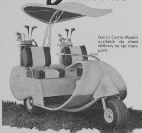
Gas or Electric Models available via direct delivery on our transports.