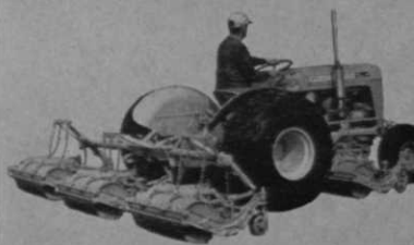
Hydraulic lift type Park Challenger