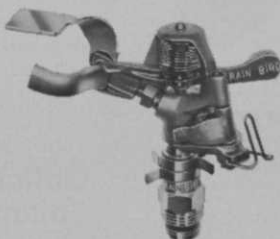
Our exclusive Precision Jet keeps water off walks and driveways.