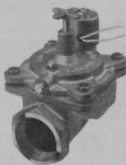
Rain Bird Electric Remote Control Valves for automatic sprinkling.