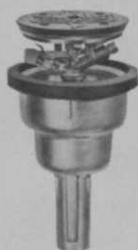
Rotor Pop-Up that won't get in the way of mowers or golf balls.