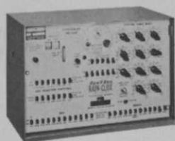
Rain-Clox Electronic Controller for reliable programming.