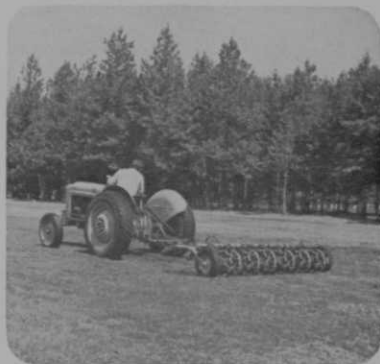
Aerating the turf at Brandywine with Ford tractor power.