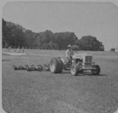
Mowing the 125-acre Greenhill course with Ford Low-Center-of-Gravity tractor.