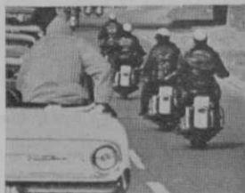
Proved in Police Fleet-Service For Over Fifty Years

Harley-Davidson dealers have the personnel and facilities to keep your fleets in continuous operation. They stock a healthy supply of parts for both gas and electric models. Result? Fast, efficient, local service that keeps your fleet out on the course earning profits.