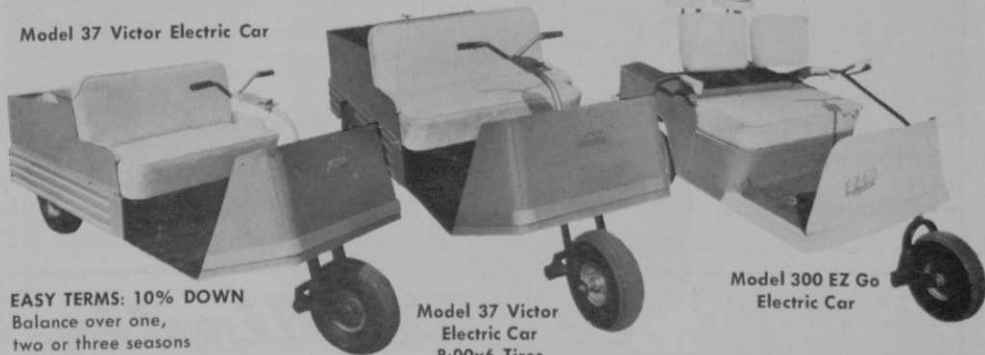
Model 37 Victor Electric Car

EASY TERMS: 10% DOWN Balance over one, two or three seasons